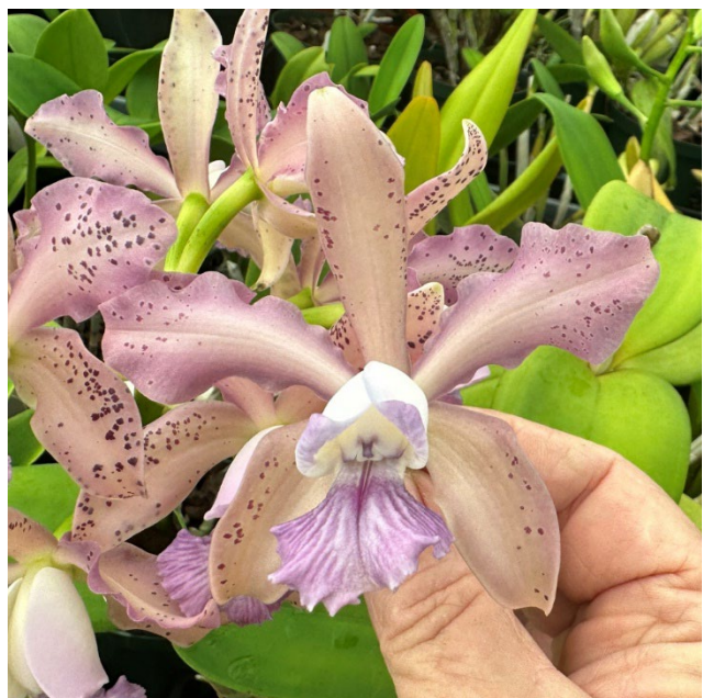
The typical diploid version of C. Leoloddiglossa 'Exotic Orchids' AM/AOS

Fred Clarke posted a picture of C. Leoloddiglossa 'Exotic Orchids' AM/AOS on Facebook, describing it as a 4n form. He had purchased ten mericlone seedlings, so they were theoretically all genetically identical. As he bloomed them out, he found one that exhibited tetraploid characteristics: the flowers had better form and color, the petals and sepals were wider and had better substance and the column was so wide that it caused the side lobes to open around it.