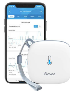
Govee Model H5179 Temperature and Humidity Sensor

Of course, mercury thermometers don't have all the bells and whistles that some of the digital devices offer, like remote monitoring, alarms and phone notifications. I have a box of failed temperature and humidity monitors, but this year discovered one that seems to work really well: a Govee H5179 thermometer/hygrometer combination that measures both temperature and humidity. This is a battery powered sensor that communicates to your phone via a 2.4 GHz WiFi connection using the Govee Home app, for either Android or Apple devices. You can get the instantaneous readings on your phone using their Widget, as well as view the data from the last hour, day, week, month or year on your phone. You can check the temperature in your growing area whether you're sitting in front of the TV at home or up in the mountains of North Carolina. You can set high and low temperature alarms, so a notification is sent to your phone in the event temperatures are outside of your preset acceptable range. Another nice feature is the low battery