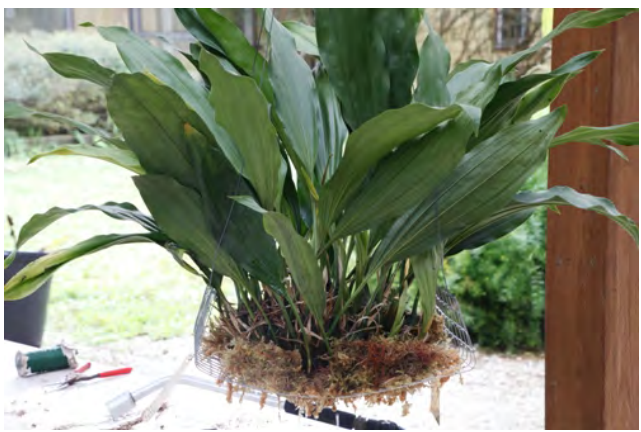
14. A good watering and wait for the roots to reestablish.