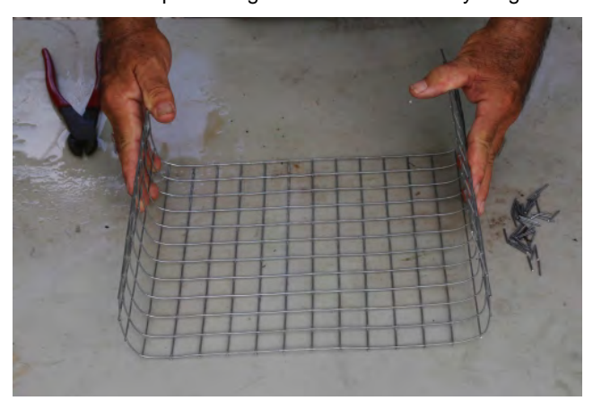
8. Voilá, your basket is reporting for duty.