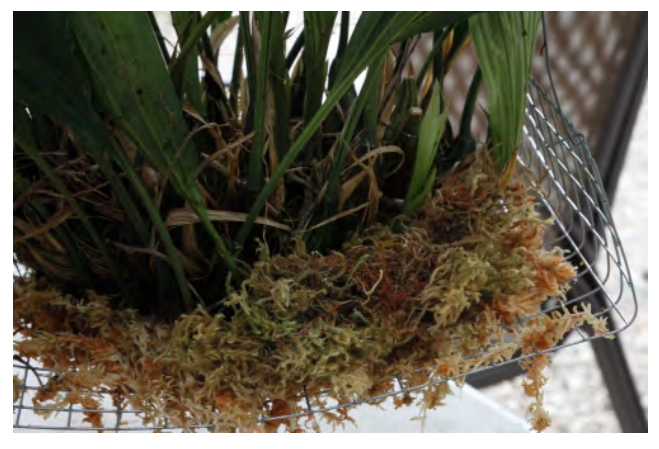
12. Cover the edges with green tree moss.