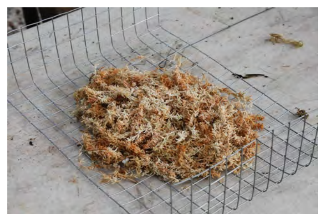
9. Add a thin layer of wet sphagnum moss.