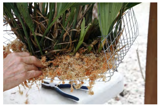
11. Add a little sphagnum around the roots.