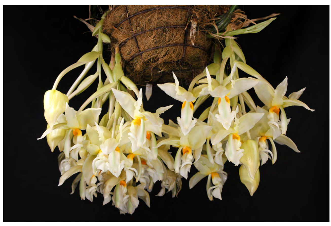
1. Stanhopea inodora with beautiful and fragrant flowers emerging from the sides of the basket.

When you first start growing orchids, you scoff at the idea of growing one that blooms for only 2 or 3 days at a time. That reticence flies out the window once you see a Stanhopea in bloom. Stanhopeas are generally grown in baskets with wide openings to allow the ephemeral flowers to emerge from the bottom or side of the basket. Squat vanda baskets and lined wire baskets are often used with a variety of mixes including sphagnum, bark or custom blends. Here are some thoughts on how to basket your stanhopeas.