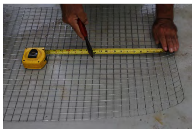
4. Measure twice and cut once! Decide what size basket you need to house your plant.