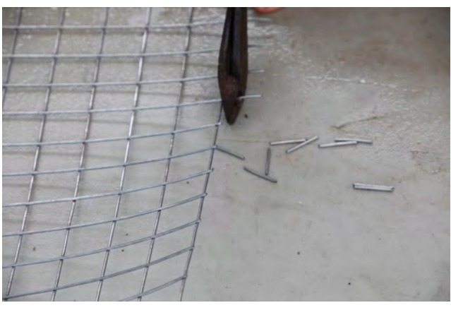
6. Remove the extra wire using snips to prevent blood loss later. That protruding wire catches on everything.