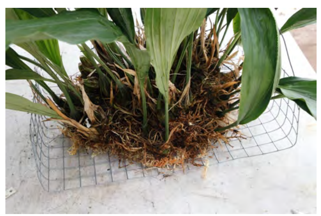
10. Place your Stanhopea on top of the moss.