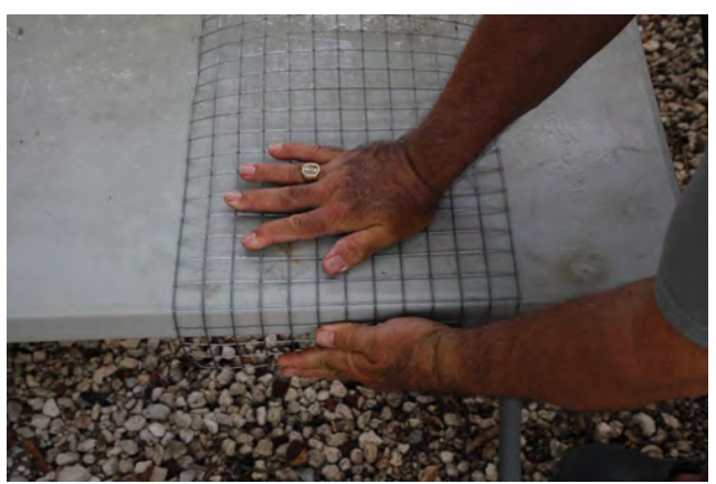
7. Bend each end of the basket, wires will be attached later.