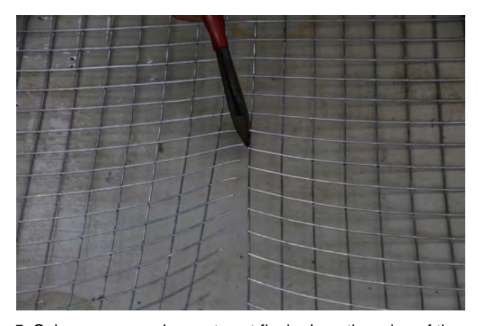
Snip away, use nippers to cut flush along the edge of the wire.