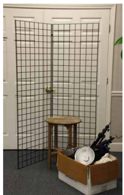
Wire grid & collapsible rack were stored in the closet, and the table and box of gear were brought in from the car. Now it's set up time.

plants connected to their names and growers, we have put together a printed label that the grower can fill out when they come to the meeting; or they can download it from the club website (http://www.staugorchidsociety.org/PDF/ShowTableEntriesInteractive.pdf), fill in the information on their computer and print it out at home. I photograph the label before I start shooting the plant, that way I don't have any confusion about matching names with pictures in post production. Plus I don't have to touch and possibly misplace or break the plant tag