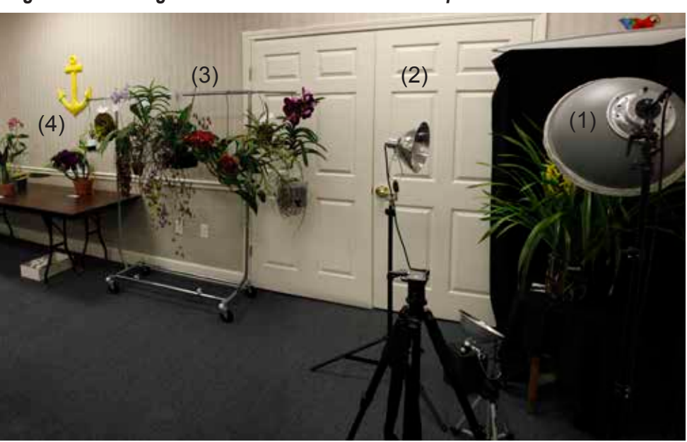
Wire grid and table are covered with fabric, lights are all set up, collapsible rack is erected and show table is full of orchids. Time to shoot.