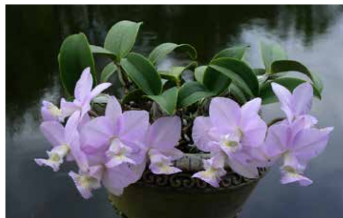
Cattleya nobilior 'Fabio Nahas'