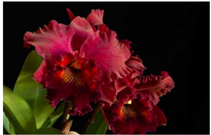
Grower Bev Vycital Blc. Heaven's Gate 'Crystelle' FCC/AOS