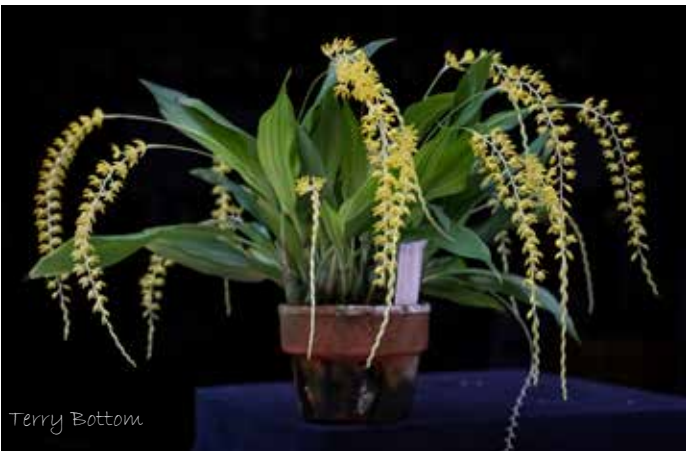
Grower Sue Bottom Ddc. formosanum