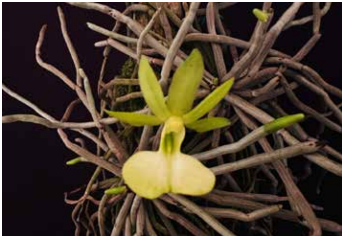
Grower Suzanne Susko Dendrophylax funalis