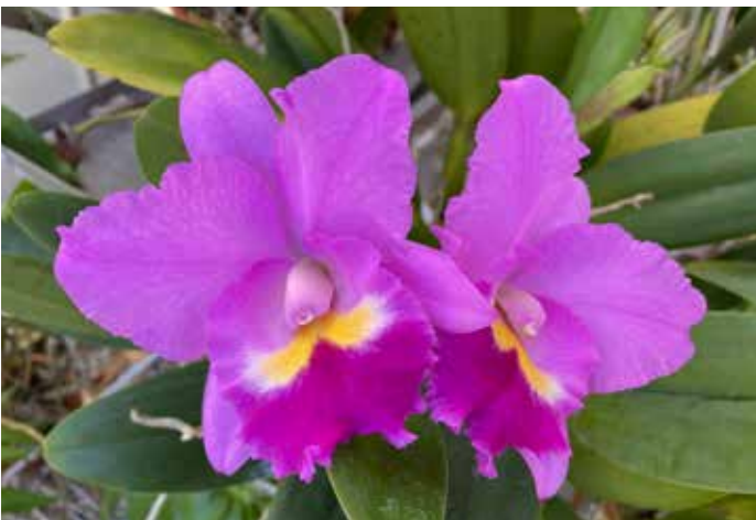
Grower Janis Croft Lc. (Aloha Case x Casitas Spring)