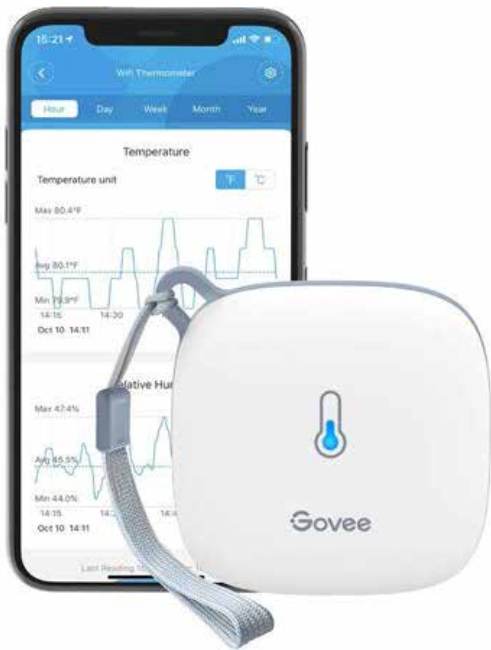
Govee Model H5179 Temperature and Humidity Sensor

growing area whether you're sitting in front of the TV at home or up in the mountains of North Carolina. You can set high and low temperature alarms, so a notification is sent to your phone in the event temperatures are outside of your preset acceptable range. Another nice feature is the low battery warning light, to let you know it's time to switch out