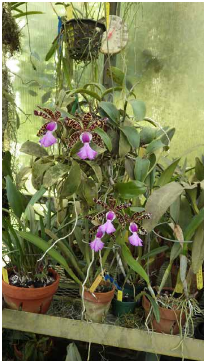
Cattleya aclandiae 'Dave Congleton' - grown and photographed by Courtney Hackney

One of the most frequent problems addressed to our "Question Box" concerns the absolute stubbornness of certain bifoliate Cattleya species to adapt to captivity. From the mail received over the years and from talking to growers across the country, Cattleya aclandiae seems to be the most recalcitrant of all. The typical response to its culture in pots is either bacterial or fungal spotting of leaves or a loss of roots followed by general decline.