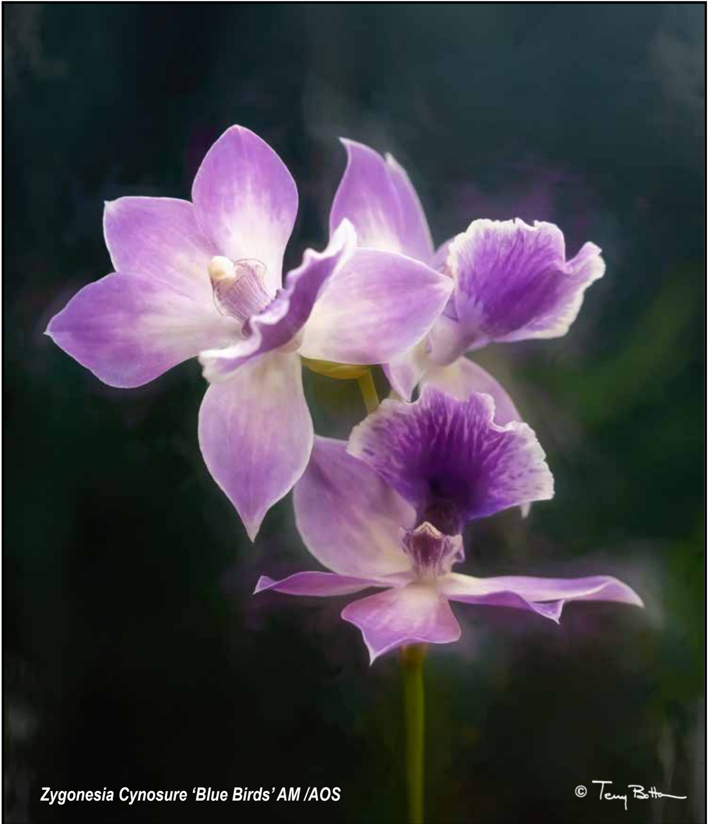
Zygonesia Cynosure 'Blue Birds' AM /AOS