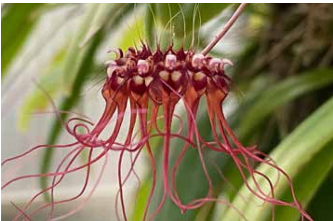
Grower Leslie Brickell Bulb. gracillimum 'Joy's Dancing Spider' AM/AOS