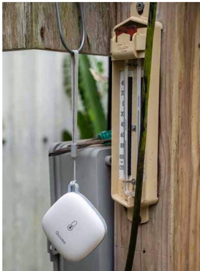
Digital vs. Manual Thermometers

You'll find yourself resetting these thermometer often during the hottest days of the summer and coolest nights of the winter, as you try to protect your orchids from temperature extremes. You can position them in different areas of your growing area to find the microclimates most suitable for growing different varieties of orchids. They work consistently and they don't require batteries that seem to always fail on the coldest night.