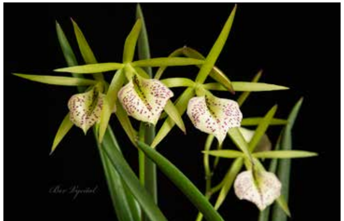
Grower Bev Vycital Bc. Binosa 'Key Lime'