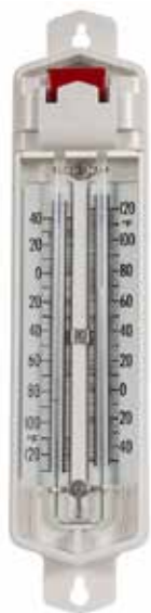
Taylor Model 5458 Max Min Thermometer

The simplest and most foolproof way to monitor temperatures in your growing area is to use a max-min thermometer. This is a mercury filled thermometer with a U tube, which will register the current temperature, as well as the lowest and highest temperatures experienced since the last reset. Some have a button reset, others use a magnet to reset the temperature. The mercury travels in a U tube inside the thermometer, rising to the maximum in the channel to the right during the day, and dropping to the minimum in the channel to the left at night. Taylor Scientific has a model 5458 for about $20.