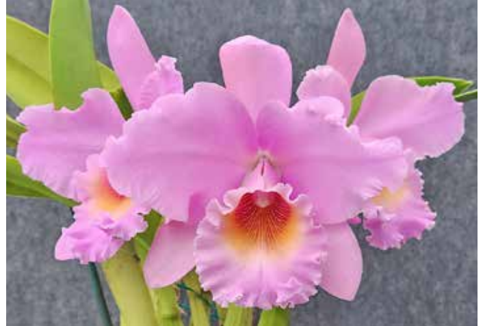
Grower Allen Black Pot. Pamela Ann Oliveros 'Mom's Best' AM/AOS