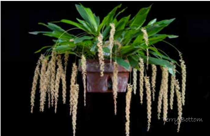
Grower Sue Bottom Ddc. bicallosum