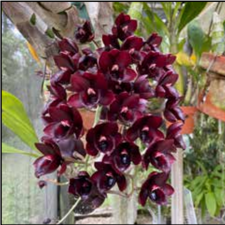
Grower Janis Croft Fdk. After Dark 'Black Pearl'