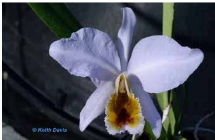
C. percivaliana var. coerulea 'Ondine', grown and photographed by Keith Davis

Because of its vigorous growing habit and small size, C. percivaliana makes a great exhibition plant if potted on into the next larger pot without disturbing the rootball. Under these circumstances, you can have a plant in a 6-inch pot with 10 or 12 flowers- and you can have it for Christmas.