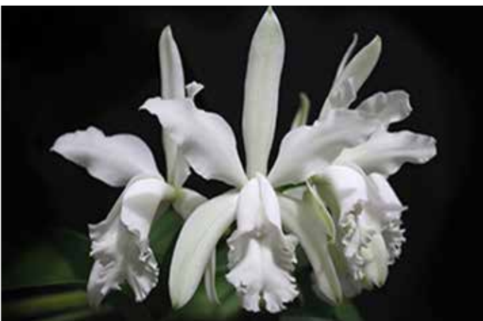
Grower Bob Schimmel C. intermedia var. alba 'Lines'