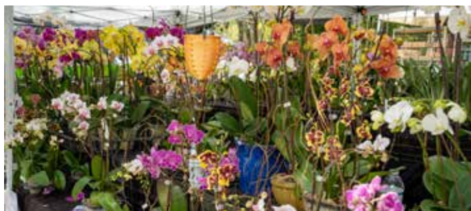
Orchid Society shows and festivals are great opportunities to shop for orchids

Healthy Root System. You know a healthy root system is the key to a plant that will bloom well for you. Any plant you buy should be fully established in the pot. Pick it up by its