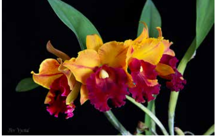
Grower Bev Vycital Blc. Smiley Aoki