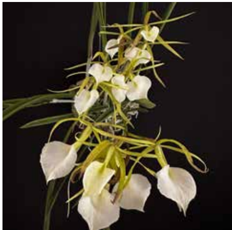
Grower Suzanne Susko B. Little Stars