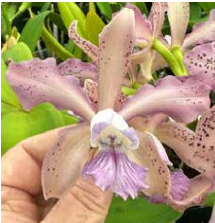
The typical diploid version of C. Leoloddiglossa 'Exotic Orchids' AM/AOS, photos courtesy of Fred Clarke

An increase in ploidy in orchids is often accompanied by an increase in size of plant parts. Plants are stockier; leaves are darker green, wider, and thicker; and flowers are of improved form. Due to the increase in width and substance of sepals and petals, the flowers are often erect, sturdy, and compact, characteristics that are desired for exhibition purposes.