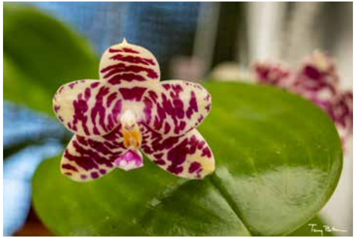
Grower Sue Bottom Phal. KS Super Zebra 'Pylo' AM/AOS

Link to all Submissions: https://flic.kr/s/aHBqjAXosh