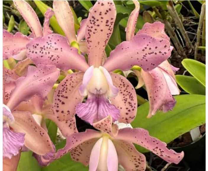
The tetraploid version of C. Leoloddiglossa 'Exotic Orchids' AM/AOS, containing an the extra set of chromosomes added during the cloning process

Tetraploids are highly valued by hybridizers, particularly when tetraploids are bred with tetraploids to produce tetraploid offspring that tend to be very uniform, with larger flower size and enhanced fertility. Fred proved that the chance tetraploid converted Leoloddiglossa seedling was a tetraploid by selfing it. The cross was very fertile and produced a seedling batch of tetraploid Leoloddiglossas that looked so similar they might have been clones.