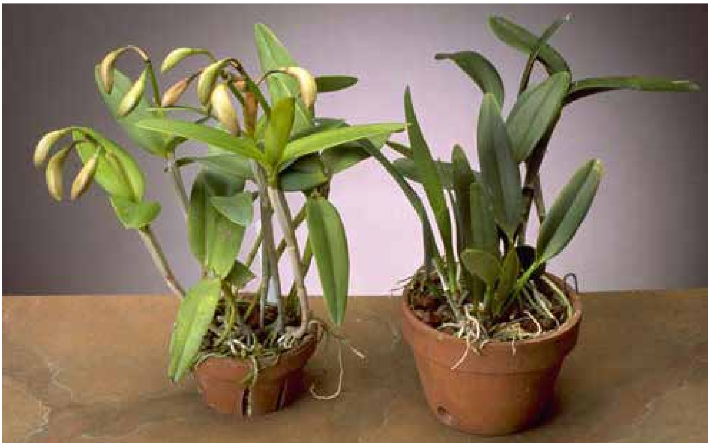
The plant on the left has received enough light to produce flowers while the one on the right has not. Note the difference in leaf color.