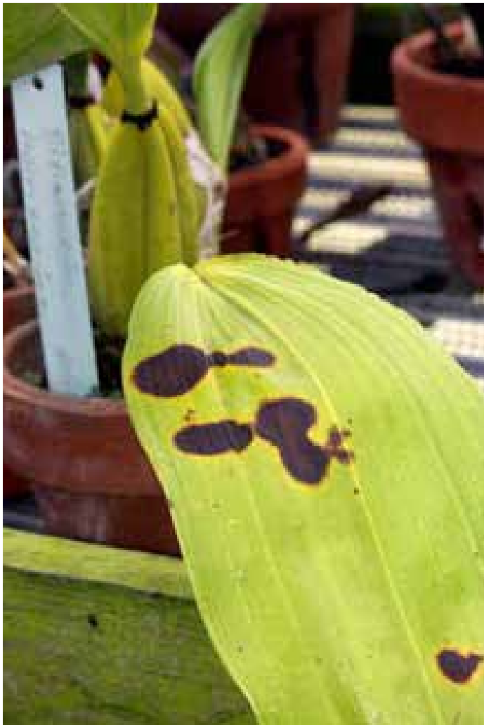
Too much sunlight will burn an orchid's leaves.

knowledge to time flowering for important holidays and it's used today by Poinsettia growers for the Christmas market. Why is this important to the hobby grower? It's really quite simple. While a street light outside your greenhouse or living room window will produce such little light that being on all night won't matter that's not the case for lights in your growing area. If your only choice for a growing area is one that is lit late into the night, it would be best to concentrate on those plants like Phalaenopsis that flower without regard to day length.