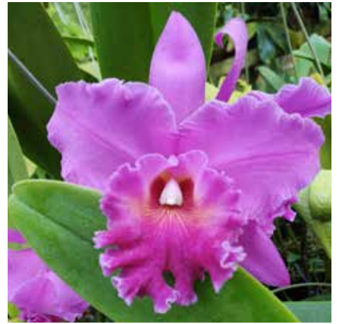
Grower Courtney Hackney Blc. Norman's Bay 'Low' FCC/AOS