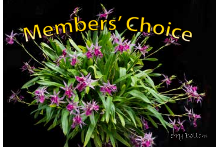
Grower Sue Bottom Mtssa. Dark Star 'Darth Vader' AM/AOS