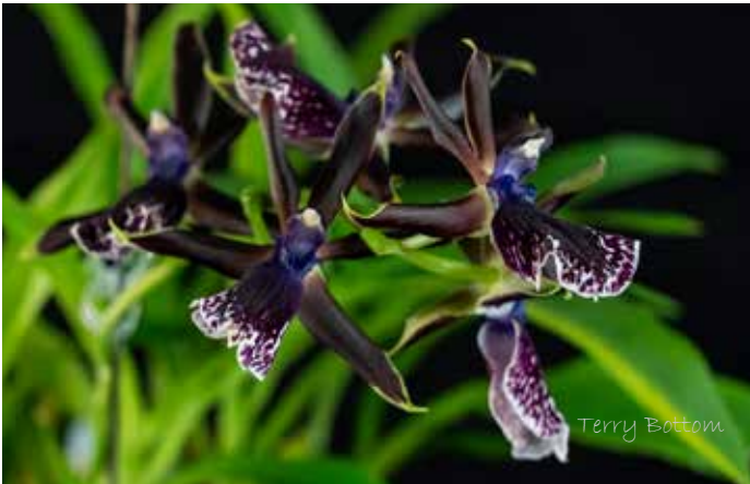
Grower Sue Bottom Zygolum Louisendorf grex