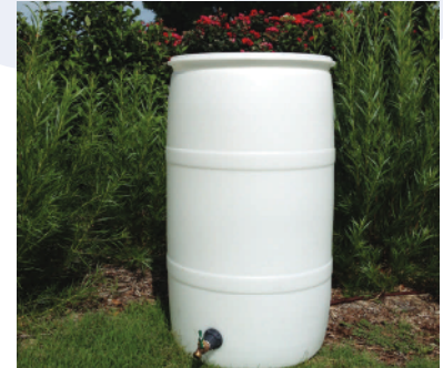
Rainwater Harvesting “Saving from a Rainy Day”