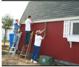
Catching Rain with gutters or a roof valley