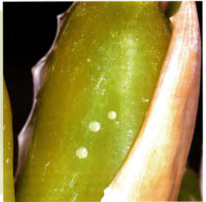
Three mature female and several nymphs on newly infested pseudobulb.

Boisduval scales have a three-stage life history: egg, larva (or nymph), and adult. Eggs are laid under the female's protective scale covering, and then she dies. The eggs hatch five to seven days after being laid. There are typically only two larval instars. The ambulatory first instar nymphs, called crawlers, are tiny (ca. 0.18 mm in length) pale yellow, and leave the protective cover to find feeding sites. The crawler instar is the active dispersal and least protected instar that moves between plants, rides air currents, and is the most susceptible to control methods. After finding a suitable place for feeding, the crawler will settle, begin feeding