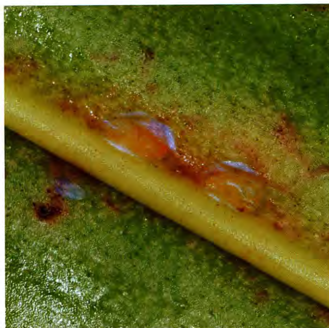
Two newly matured female Boisduval scale developing protective layer along midrib of leaf.

The most common way of acquiring scale is by purchase of an infested plant. Even a plant that appears scale-free may have hidden crawlers or females. Scales are also easily transmitted from infested to clean plants when your plants touch each other and the crawlers move from plant to plant.