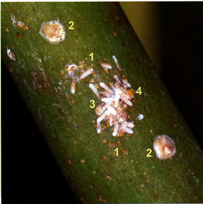
A cluster of Boisduval scale developmental stages:

Individual Boisduval scales have short life cycles, measurable in weeks, but may have a number of generations per year. In a warm greenhouse, the life cycle for