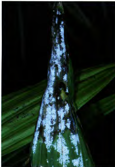
Ventral aspect of Phaius leaf showing a heavy infestation and characteristic wilting and curling damage.

Because of plant costs, personal attachment to plants by owners, and well-meaning desires to avoid insecticides, a variety of home remedies for scale control have been developed over the years by hobby growers. Though such methods may be useful for removing