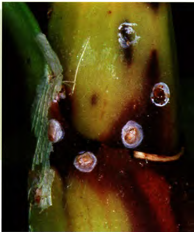
Seven dead female Boisduval scale found under dry bract of pseudobulb on a Schomburgkia .

or ball of cotton dipped in isopropyl (rubbing) alcohol. Be cautious with other alcohols, such as ethanol, methanol or methylated spirits (denatured alcohol) in a concentrated form, as these can penetrate the plant tissues rapidly and cause considerable damage to soft tissues! These alcohols are used botanically to preserve plant tissues! The concentration of the isopropyl seems to make little difference; the common 70% available in hardware stores and pharmacies is satisfactory. On hard-leaved plants, gentle rubbing with the fingers or a soft toothbrush is effective, with or without the alcohol. Remove all scales, large and small. Afterwards, allow the plant to dry and re-examine it. You may be surprised to find many residual scale bodies, so repeat the alcohol wipe to remove all traces of the insects. Pay particular attention to the midrib, other veins, and leaf edge areas, and do not overlook creases on pseudobulbs or even roots. Because the eggs are hidden under the waxy covering of the dead female, if these are not