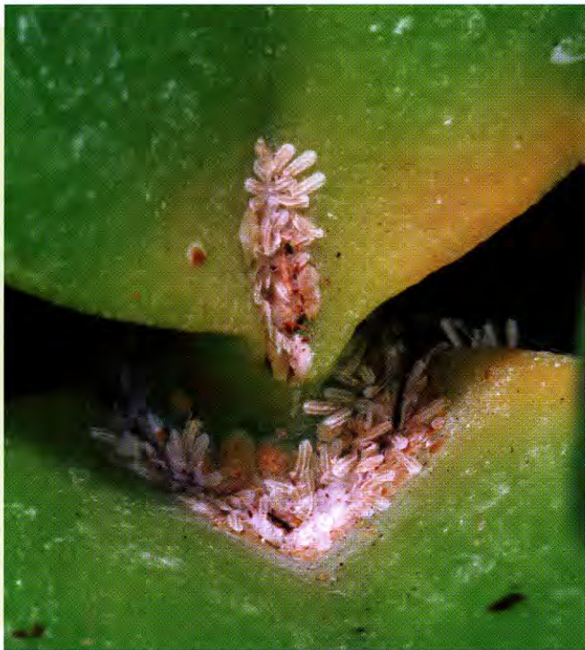
Leaf bases of a Sophrolaeliocattleya with crevices filled with scale.

Severe and persistent populations of scale or infestation in many plants often demand the need for use of synthetic insecticides. There are few insecticides specifically registered for use on orchids, but there are common, inexpensive, home-and-garden chemicals labeled for ornamental plants. The most commonly used and effective insecticides are listed in the adjoining table. Avoid insecticide formulations not labeled for ornamental plants as these are often mixed with solvents that aid in the application of the active ingredient. It is these solvents, not necessarily the insecticide itself, that often produce phytotoxicity and may seriously damage