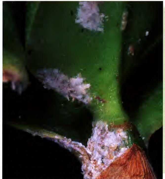
A leaf underside and upper pseudobulb of a Sophrolaeliocattleya hybrid with masses of Boisduval scale.

Sterilants are usually solutions commonly marketed as Physan 20, RD20, or Consan 20, amongst other brand names, and these are used as anti-bacterial, anti-algal, and anti-fungal agents. These solutions are composed of isomeric mixtures of quaternary ammonium chlorides, and all have similar antibiotic activity. Quaternary ammonium chloride solutions are common cleaners used by commercial kitchens, janitorial serv-