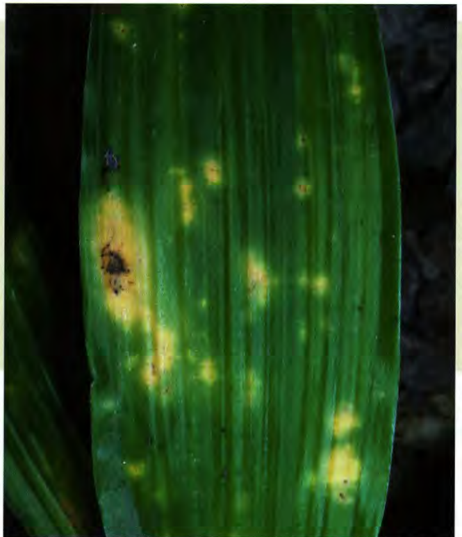
Dorsal aspect of a Phaius leaf showing characteristic patchy chlorosis from feeding. Scales are on underside of leaf.

The ladybeetles Telsimia nitida and Lindorus lophanthae (Coleoptera, Coccinellidae) and a Cybocephalus sp. (Coleoptera, Cybocephalidae) are reported to feed on Boisduval scale. I have observed feeding by the convergent ladybeetle ( Hippodamia convergens ) and the otherwise invasive Asian ladybeetle ( Harmonia axyridis ), but not with significant population reducing effects. Ants ( Pheidole sp.) may feed on crawlers occasionally but otherwise seem disinterested in Boisduval scale. None of these are reliable for the necessary intensity or dura-