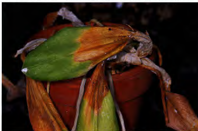
A Sophrolaeliocattleya that died from scale.

Heavy infestations of scale, especially on many plants, will require control methods over a long period of time. In such situations, you may need to consider the use of a synthetic insecticide. On the extreme side, if you have a plant showing signs of decline from scale, you may have to seriously consider destroying that plant as a low likelihood of rejuvenating that plant may not justify the expense and effort of continued treatments, or risk infestations to additional plants. After all, the destruction of a sick plant can be used to justify