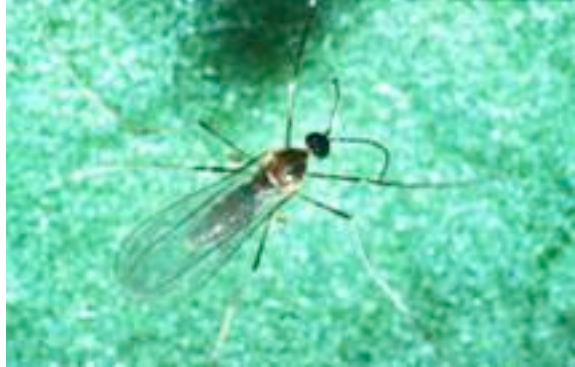
Aphid midge. The aphid midge (Aphidoletes aphidomyza) is a small insect and a

member of the same family of true flies (Order Diptera, Family Cecidomyiidae) as the Dendrobium blossom midge. It is generally similar in its small and delicate size, dark color, long legs, and slender body. However, the aphid midge has a predatory larva that reportedly may feed on 10-100 aphids depending on the size of the aphids and the environmental conditions. The aphid midge requires high humidity and is most effective with