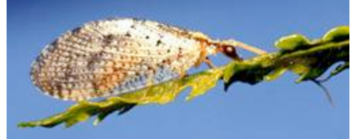
are attracted to lights and will enter unscreened greenhouses.

Lacewings require only moderate humidity and temperatures. The adults feed on honeydew, sugar water, and other liquids, though some of the brown lacewings